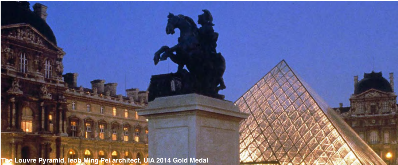
The Louvre Pyramid, Ieoh Ming Pei architect, UIA 2014 Gold Medal