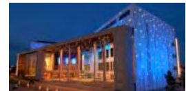
Palace of Arts, Budapest Gábor Zoboki, architect