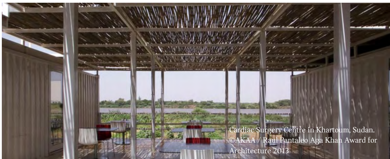
Cardiac Surgery Centre in Khartoum, Sudan. Aga Khan Award for Architecture 2013