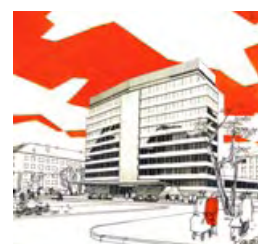
Estonian Ministry of Foreign Affairs, built in 1963 to house the Estonian Communist Party headquarters.