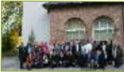
UIA Council in front of the Crédit Mutuel headquarters that was made available for the occasion to the UIA by that bank.