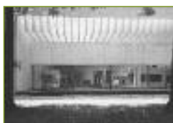
Nordic Pavilion in Giardini, Venice. Architect Sverre Fehn, 1962.