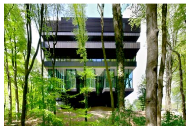
Rehabilitation Centre Groot Klimmendaal