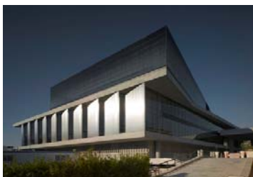
Acropolis Museum