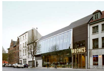
Bronks Youth Theatre