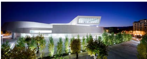
MAXXI: Museum of XXI Century Arts