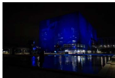
Concert House Danish Radio