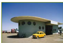
Shell Service Station