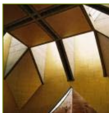
Church in Bergamo Mario Botta, architect